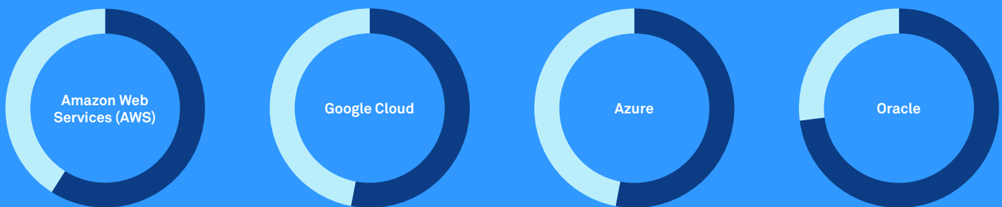
Market Share of Hyperscale Cloud on Ramp Nodes

Percentage of Cloud Edge Nodes only includes markets where Equinix has an IBX. Cloud Provider Websites as of December 2022.