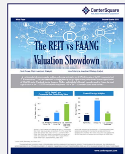
June 2018 The REITs vs FAANG Valuation Showdown