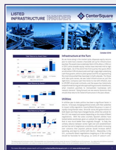
October 2018 Listed Infrastructure Insider