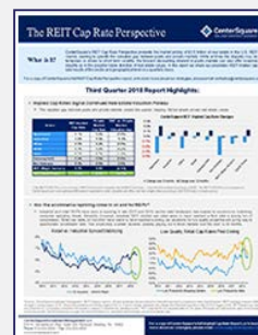
September 2018 REIT Cap Rate Perspective