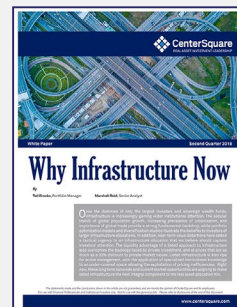
May 2018 Why Infrastructure Now