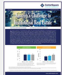
May 2018 Amazon's Challenge to Institutional Real Estate