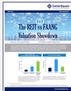
June 2018 The REITs vs FAANG Valuation Showdown